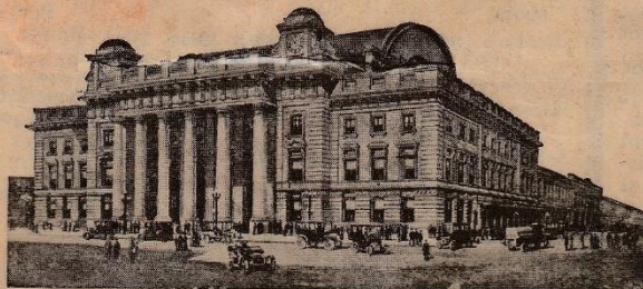
Chicago & Northwestern Railway Station, Chicago Ill., Where the Horseshoe Pitchers from Eastern Points Will Meet on Their Way to the Des Moines Tournament in August